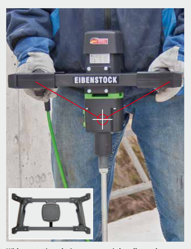
Wide, trapezium design, ergonomic handles and balanced center of gravity – easy, well balanced guiding of the machine for greater leverage