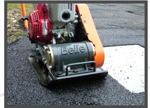
IDEAL FOR 'PATCHING'