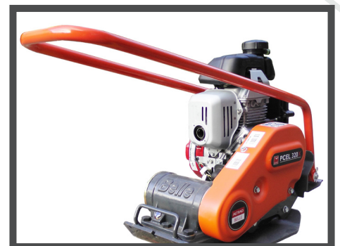
REMOVEABLE FOLD-DOWN OPERATOR HANDLE