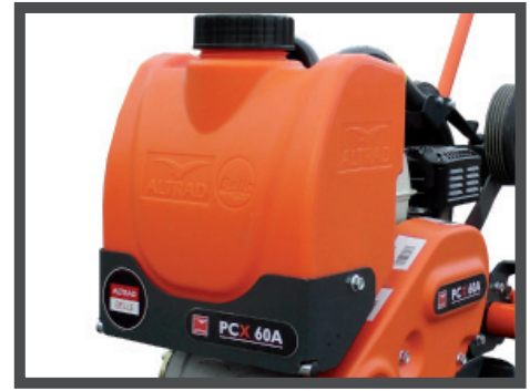
OPTIONAL 'EASY-FIT' 12LTR WATER TANK