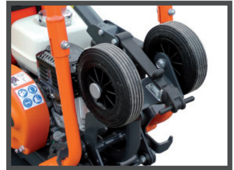
OPTIONAL INTEGRATED 'QUICK ENGAGE' WHEEL KIT