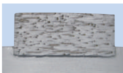
High diamond concentration