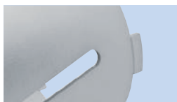
High quality slotted steel barrel