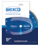
Mexco Diamond Blade product packaging