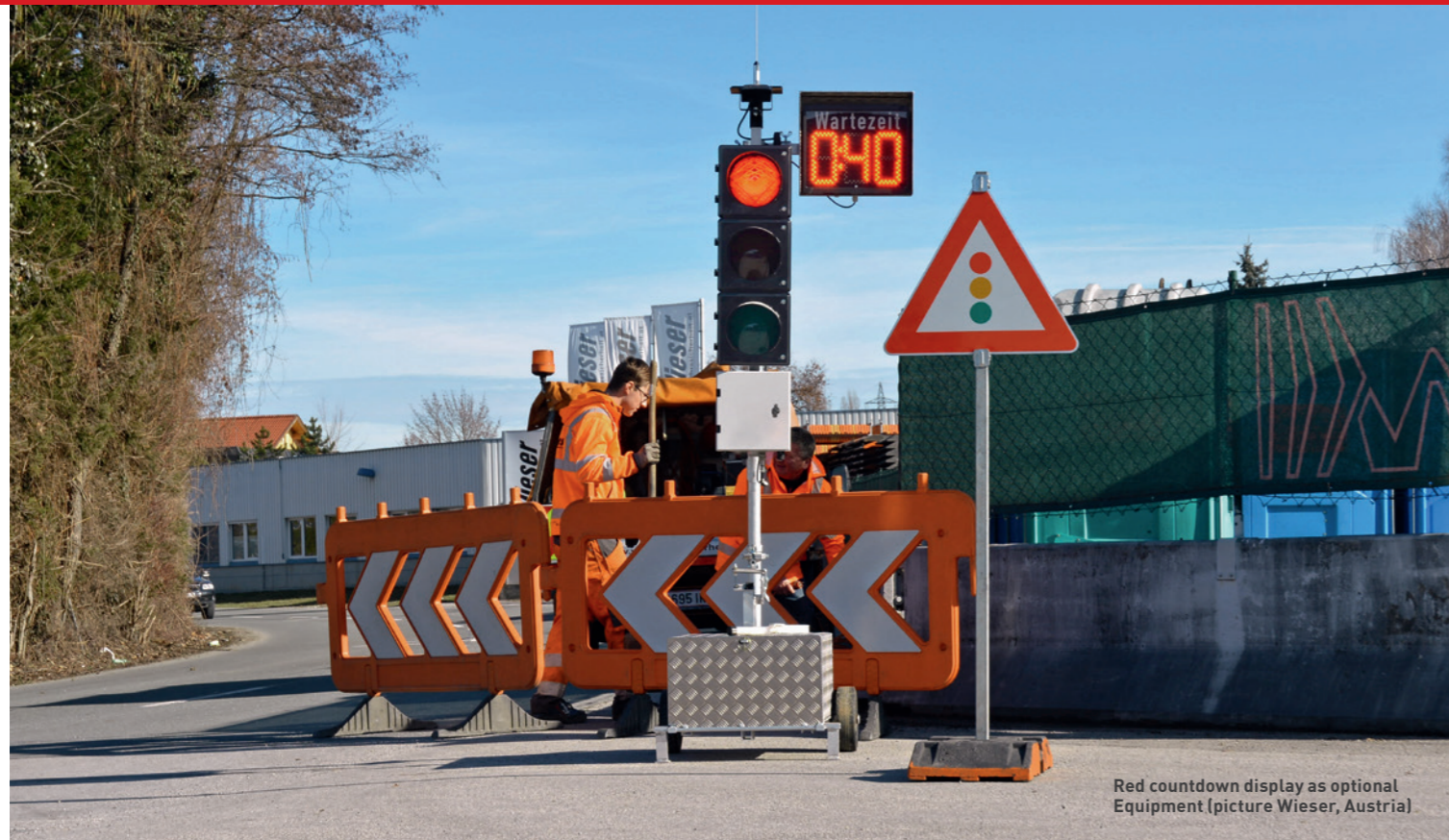
Red countdown display as optional Equipment