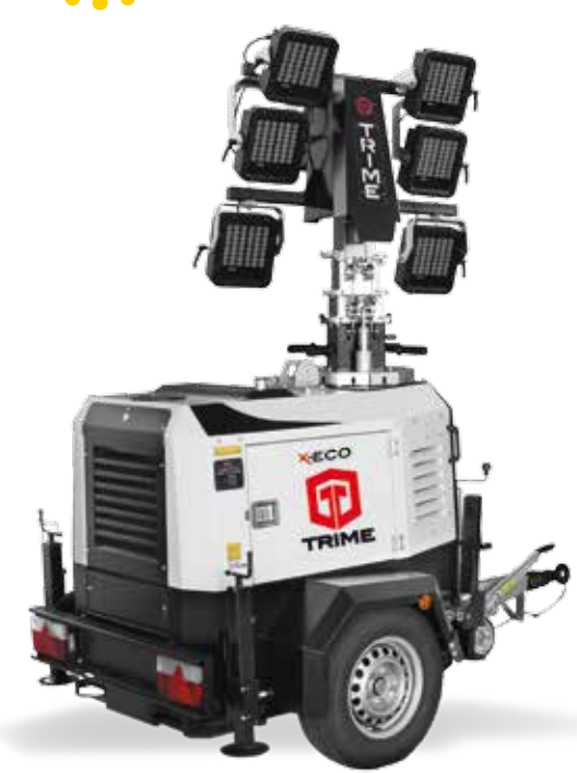
Ease of transport and handling